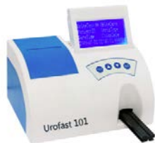
VET-10 Urine Test Strip Analyzer

BUN Whole Blood Test Strips BHB in Milk Test Strips MUN Milk Test Strips Protein/Creatinine Urine Reagent Test Strips TEN PARAMETERS (Urine Test Strips) (Glucose/Protein/pH/Bilirubin/Blood/Ketone/Urobilinogen/Ketone/Nitrite/Specific Gravity/Leukocyte)