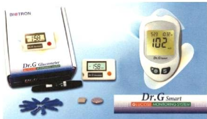
Dr. G. Glucosemeter