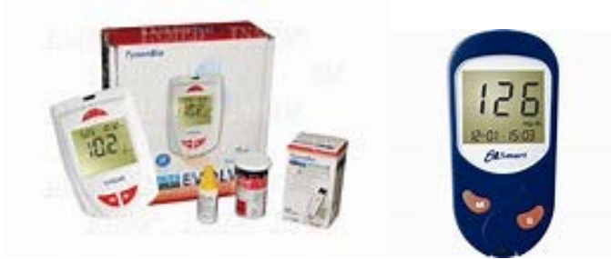
Advanced Dr. G. Smart Glucosemeter - Series (1,2, 3)